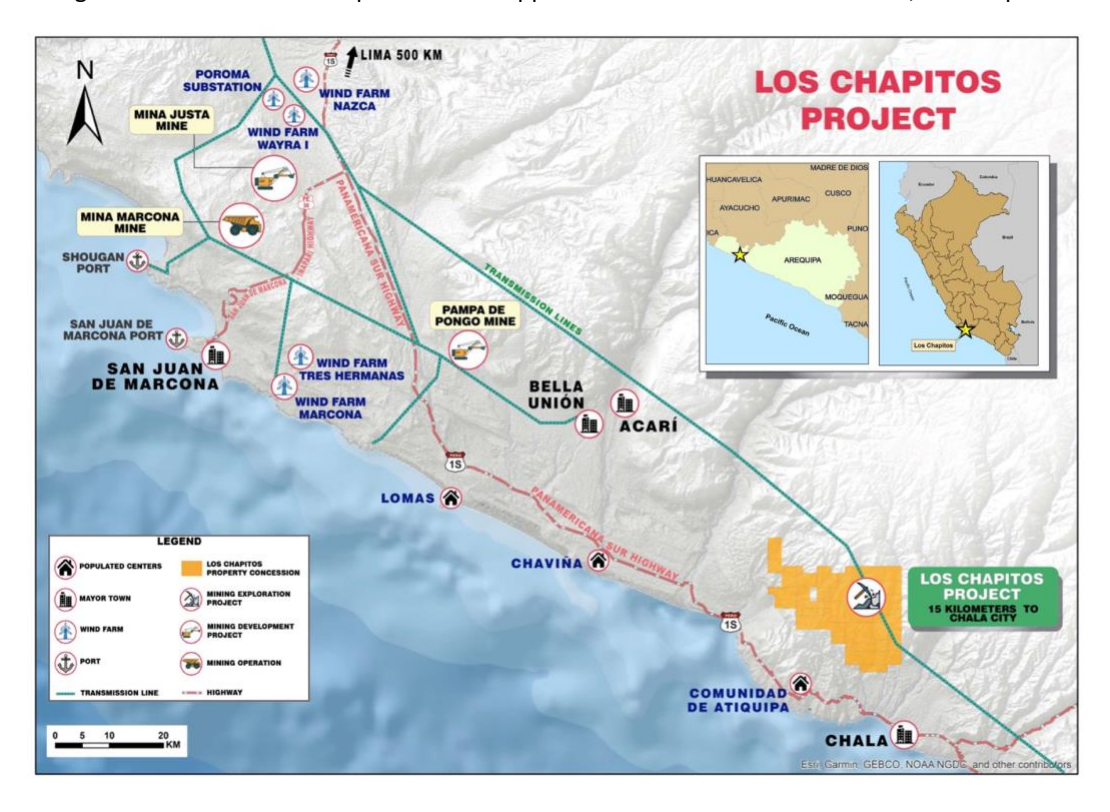
Figure 3. Location Map of the Los Chapitos Copper Project along the coastline of Peru